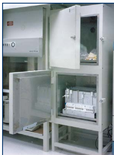
Shielded Hood with Dual Mini Cell