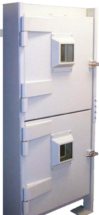
Dual Mini Cell with viewing windows