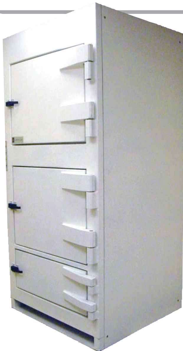
Dual Mini Cell Configuration